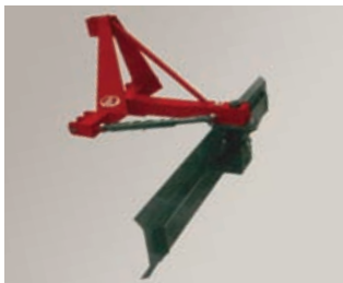
MAHINDRA 70 HP HD BLADE