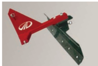
MAHINDRA 30 HP STANDARD BLADE